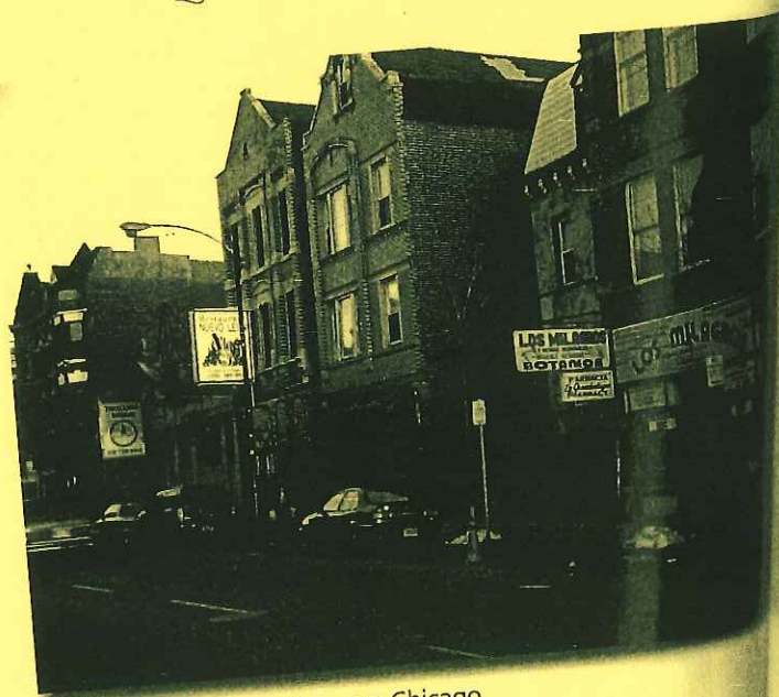
En la comunidad de Pilsen, en Chicago